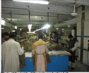
Photo of the inside of the main production hall Checking section.JPG