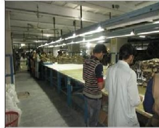
Photo of the inside of the main production hall Packing section.JPG