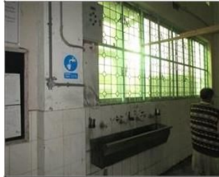
Photo of the inside of the main production hall Drinking water point.JPG