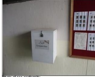
Photo of non-conformity NC Suggestion box was placed in open area near main entrance.JPG