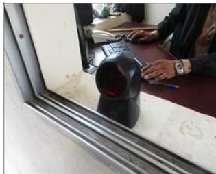
Photo of the inside of the main production hall Attendance machine.JPG