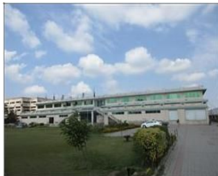
External photo(s) of the production unit(s) Factory building.JPG