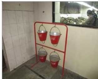
Photo of fire safety equipment Fire buckets.JPG