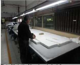
Photo of the inside of the main production hall Cutting section.JPG