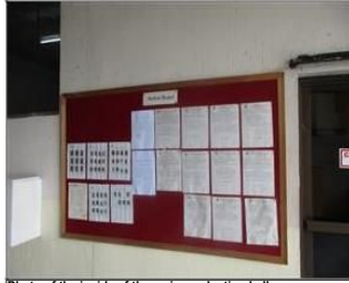
Photo of the inside of the main production hall Notice board.JPG