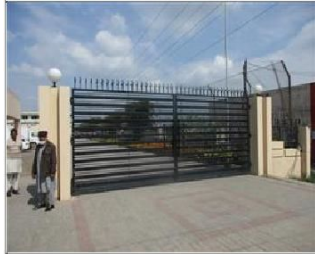
External photo(s) of the production unit(s) Factory main gate.JPG