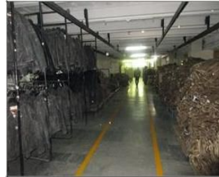
Photo of the inside of the main production hall Pathways.JPG