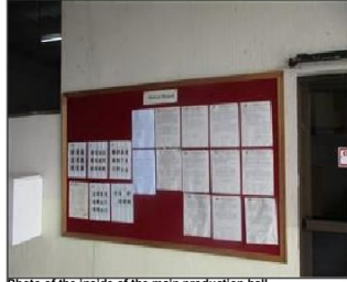
Photo of the inside of the main production hall Notice board.JPG