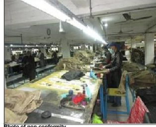
Photo of non-conformity NC Spray section in finishing section on mezzanine floor is not isolated with other production areas...JPG