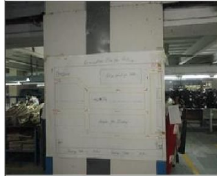
Photo of the inside of the main production hall Evacuation plan.JPG