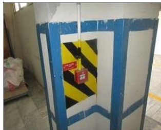
Photo of fire safety equipment Fire alarm.JPG