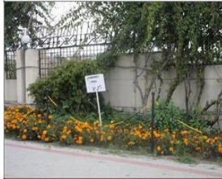
External photo(s) of the production unit(s) Assembly point.JPG