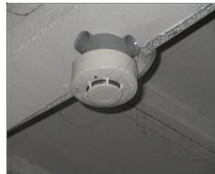
Photo of fire safety equipment Smoke detector.JPG