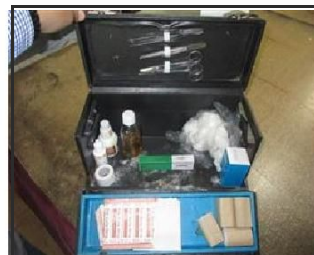
Photo first aid facilities First aid box.JPG